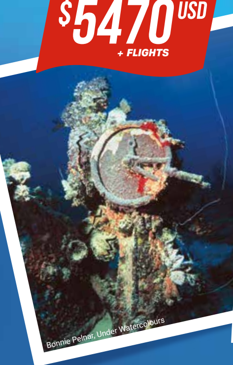
Bonnie Pelnar, Under Watercolours

PACKAGES FROM APPROX $5470 USD + FLIGHTS